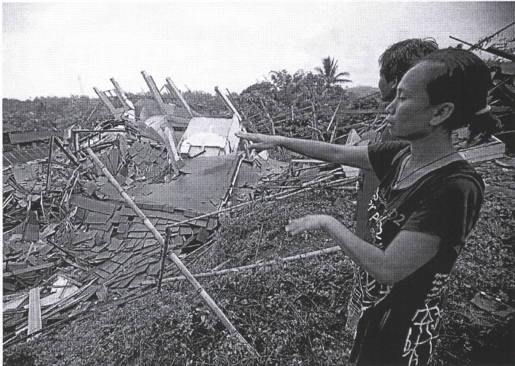
A couple survey their collapsed Chiang Rai home.