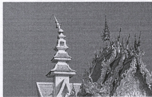
Wat Rong Khun, known as the White Temple, was damaged by the earthquake. CHINNAPAT CHAIMON