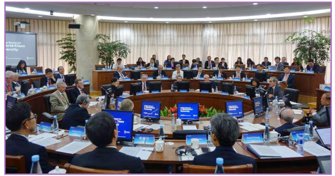
University Consortium of the 21 st Century Maritime Silk Road

All in all, this conference was a great success as all the participants shared and exchanged insightful views on BRI, LMC and GMS cooperation. The productive discussion will move China and the Greater Mekong Subregion countries forward a new era and usher in more cooperation based on the mutual understanding and benefit.