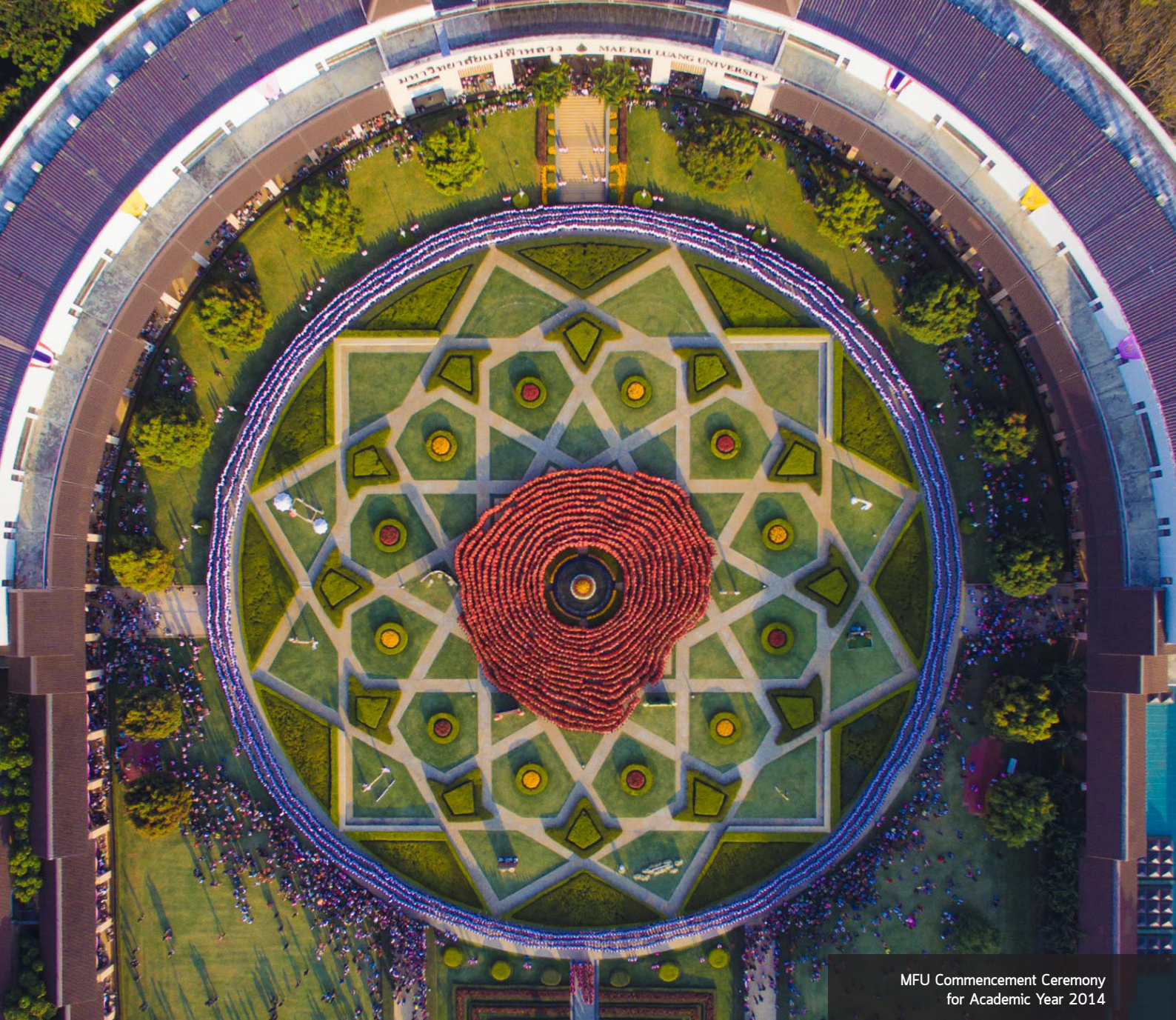
MFU Commencement Ceremony for Academic Year 2014