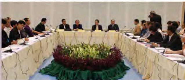
Participants from all over Chiang Rai attended the seminar