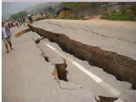
Roads were damaged during the March 24 earthquake

March 24, 2011, an earthquake, rating 6.7 on the Richter scale, centered in the Republic of the Union of Myanmar's Shan state. Affected areas included Tachileik, Tarlay and even Mae Sai, a city in Thailand. Over 25 people were killed and many houses in villages in the area were damaged. Economic stability in the region was also greatly affected, as it depends heavily on tourism and trade. Community concerns continued to grow, and in response, Mae Fah Luang University sought to allay people's fears.