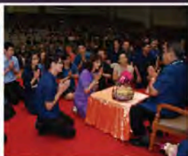
Mae Fah Luang University students, faculty and staff participate in the Rod Nam Dum Hua ceremony during the University's Songkran celebration

Thailand's Songkran festival has traditionally been celebrated as the New Year for many centuries. This April, Mae Fah Luang University celebrated a Songkran on April 20. There were many government officers, staff members, students, and press organizations in attendance at the Rod Nam Dum Hua Ceremony, in which scented water is sprinkled onto the heads of those in attendance by elders.