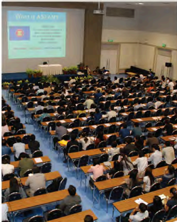
Many MFU professors and staff members attended the seminar