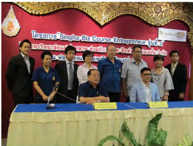
Representatives from Mae Fah Luang University and the Singha Corporation hold a press conference to announce the 2nd Singha Biz Entrepreneur Course

14 June 2011, Mae Fah Luang University, in cooperation with Singha Corporation, held a press conference announcing their intentions to conduct the second Singha Biz Entrepreneur Course from the 8th of July to the 30 th of October, at 5 different locations. The program will be organized and implemented at Mae Fah Luang University, Chiang Rai; Richmond Hotel, Bangkok; Kosa Hotel, Khon Kaen; The Royal City, Phuket; and Pinnacle Grad, Chonburi. All entrepreneurs participating in the Course will gain more knowledge of strategy management, project management, quality management, business negotiations, and more. For more information please go to http://www.singha-sme.com .