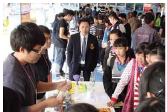
Students from the School of Science teach high school students about the joys of science.