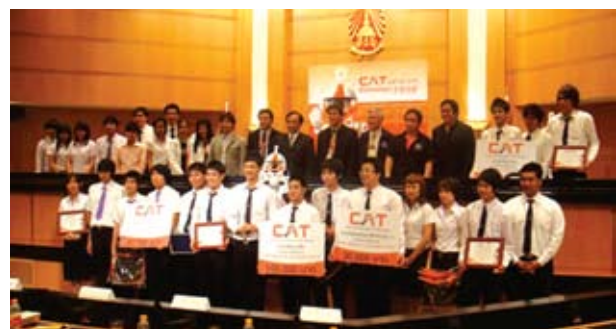
IT Students win CAT Datacom Animation Contest 2010

The ESC team received first prize with their project entitled “Dreamer Land” ( http://www.youtube.com/watch?v=miiBe_7118A ) and Tok-Tol in the Blanket team created “The Communication” ( http://www.youtube.com/watch?v=HZFd5nMfG7E&NR=1 ) receive second prize.