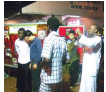
Students enjoy the activities available during the Festival