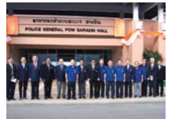
Right: Opening ceremony of the Police General Pow Sarasin Building