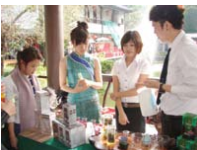
Tea-tasting and other activities at Chinese Culture Day

The Sirindhorn Chinese Language and Culture Center, the Confucius Centre and the School of Liberal Arts organized activities for Mae Fah Luang University's Chinese Culture Day 2011 on January 28 at the Sirindhorn Chinese Language and Culture Centre. Activities that day included a drawing competition, a Chinese calligraphy contest, a Chinese information quiz and a singing contest. In addition, cultural performances and exhibitions were held throughout the day. The Chinese Culture Day provided an excellent opportunity for students and the public to learn about Chinese language and culture.