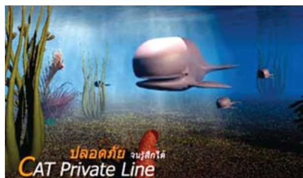
A sample of “Dreamer Land” from ESC team