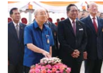
Left: Police General Pow Sarasin, Chairman of the University Council, admires the building

The Police General Pow Sarasin Building has been in progress since August 30, 2008. When funds of THB 96,070,000 became available in October of 2009, MFU was ready to break ground. The concrete building has 4 floors, 7,900 square meters, and is fully equipped with all modern convenience facilities. It