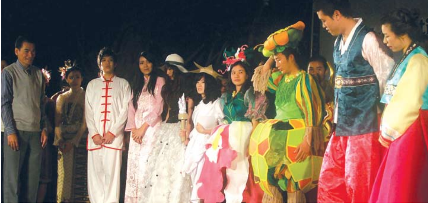
Students dress in their home countries traditional costumes for MFU's 1st Annual International Culture Festival

Over 800 students, faculty, staff, and community members attended Mae Fah Luang University's 1 st Annual International Culture Festival on January 20, 2011. Many different cultures across multiple continents were represented at this event, with performances including singing, dancing and presentations of traditional costumes. The festival, arranged by the International Affairs Division and the Student Development Division, showcased the cultures and customs of Thailand, Myanmar, the People's Republic of China, the Democratic Republic of South Korea, Bhutan, India, France, the United States of America, as well as cultures in Africa and South America.