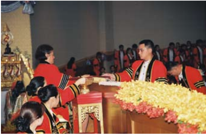
H.E. Princess Maha Chakri Sirindhorn awards degrees to MFU students

After conferring degrees, HRH Princess Sirindhorn continued to the Office of the President Building to inspect some academic exhibitions, which served to demonstrate MFU's efforts to strengthen the community through career development in tourism and agriculture. Projects included upgrading the Thai Tea by standardizing production to increase market value, production of organic goods, vermicomposting, and vermiculture.