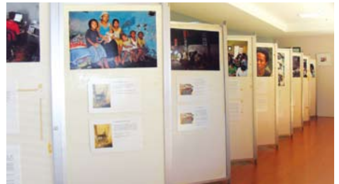
Path of Perseverance Exhibition