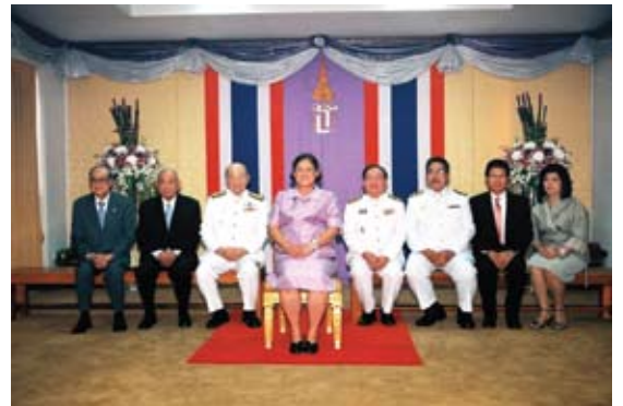
H.E. Princess Maha Chakri Sirindhorn bestows 4 honorary degrees on behalf of MFU