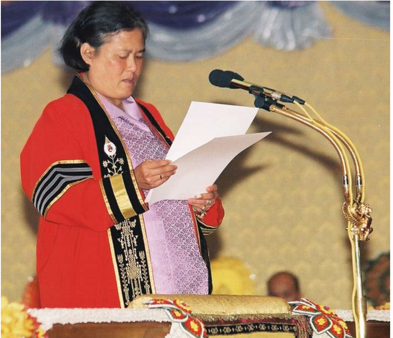
Her Excellency Princess Maha Chakri Sirindhorn addresses MFU students, faculty and staff