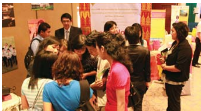
Thailand Education Fair in the Republic of the Union of Myanmar