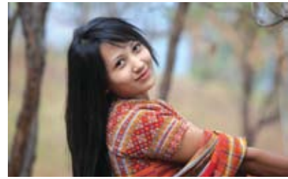
Photograph of a Chin woman featured at the Exhibition

The photographs are compelling, emotional and sublime. Manser's exhibition is a journey of conscience as well as artistic resonance. It is even more enlightening that Manser has captured 'real' un-staged images, without manipulation or persuasion. The effect created by Manser is arresting, haunting, and has absolute authority.