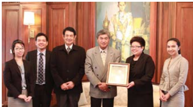
H.E. Apirath Vienravi, Ambassador of Thailand to the Republic of the Union of Myanmar welcomes MFU delegates

The following day the ambassador attended the Opening Ceremony of the "Thailand Educational Fair in Myanmar 2011" at Royal Park Hotel, where he recommended Mae Fah Luang University as an excellent option for post-secondary education for students from Myanmar, given its excellent location at the center of the Greater Mekhong Sub-region. The fair was organized by the Department of Export and the 13 participating universities. Nearly 400 students attended the Fair, and MFU received a number of applicants to both undergraduate and graduate programs. A scholarship was available for students who visited the MFU booth. Additionally, the MFU English proficiency test was available on-site to encourage more applicants.