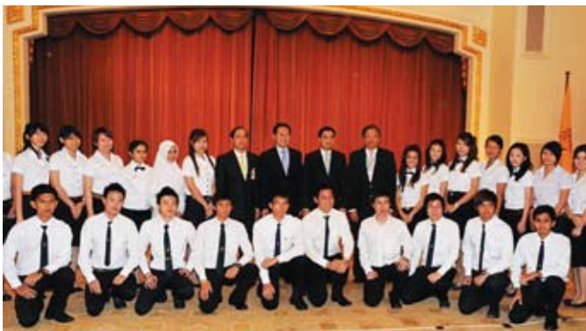
M-I-T Pilot Program students with H.E. Mr. Abhisit Vejjajiva, Prime Minister of Thailand