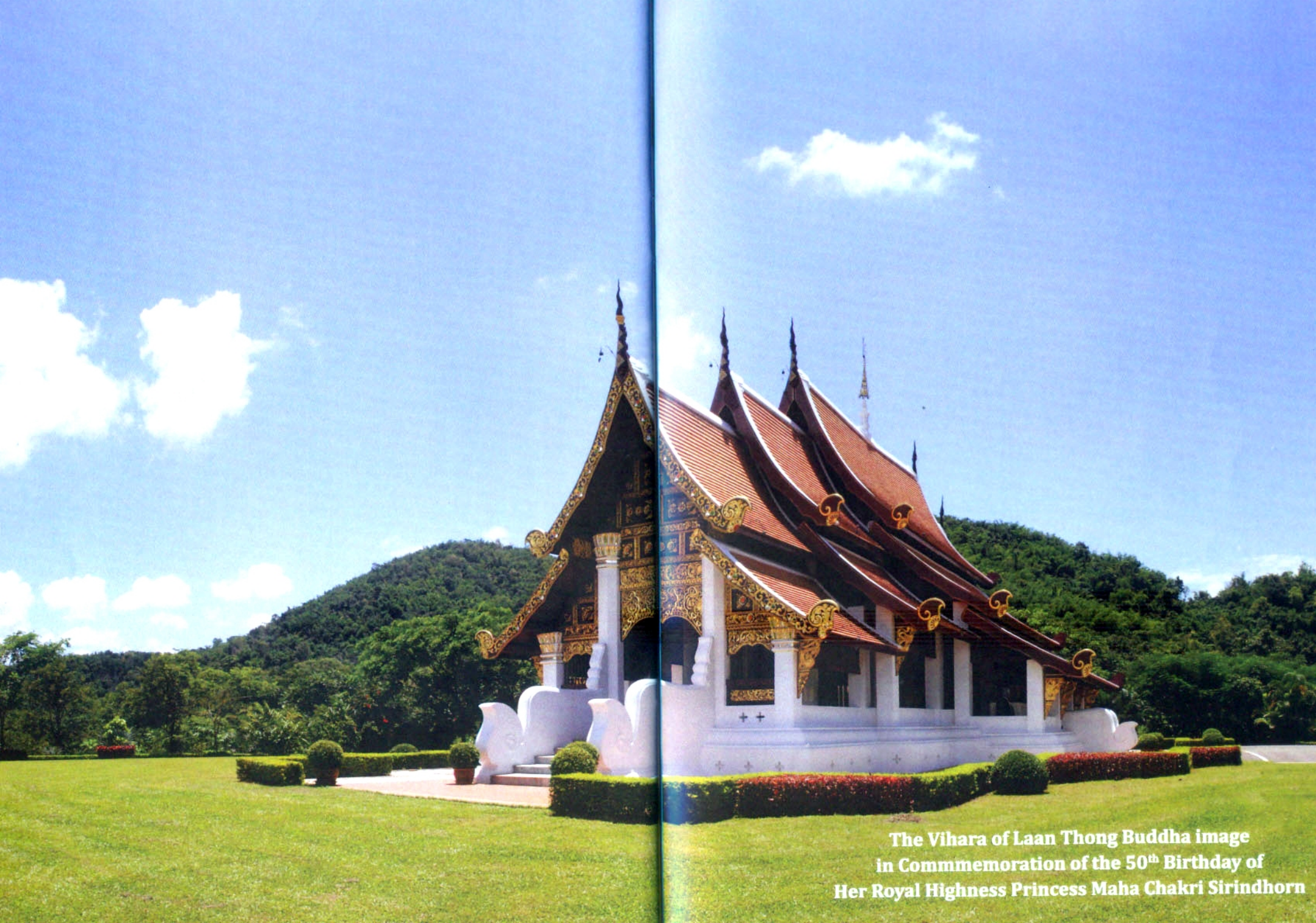
The Vihara of Laan Thong Buddha image in Commemoration of the 50 th Birthday of Her Royal Highness Princess Maha Chakri Sirindhorn