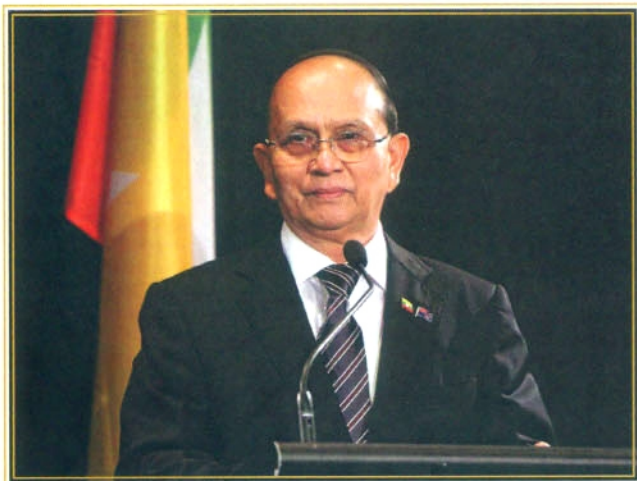
His Excellency U Thein Sein President of the Republic of the Union of Myanmar