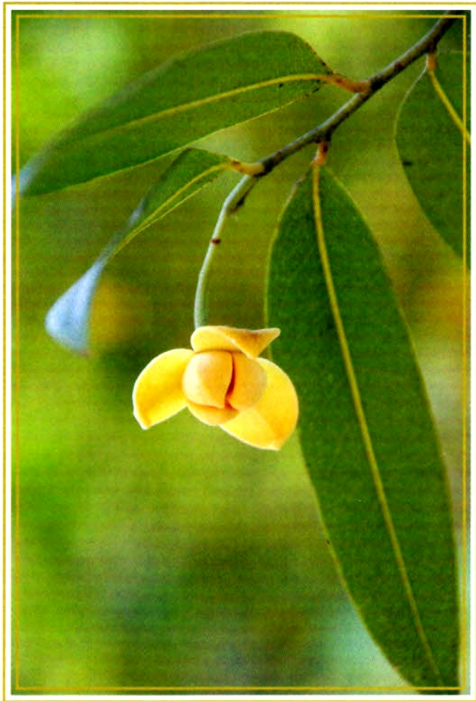
Lamduan, the Symbolic Flower of Mae Fah Luang University