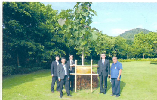
Tokyo University, Japan, signed MOU, September 16, 2008