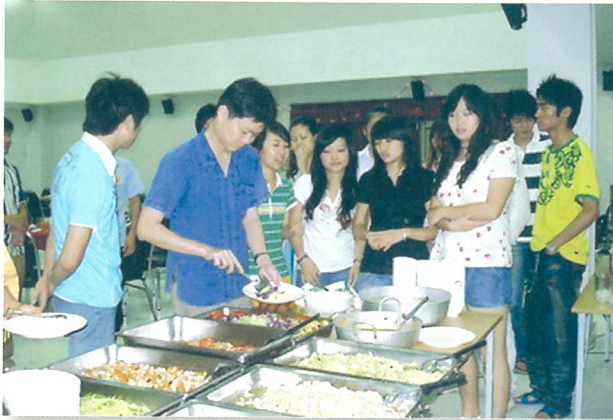
Mid Autumn Celebrations September 8, 2008