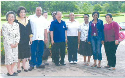
Agricultural and Food Marketing Association for Asia and the Pacific (AFMA), South Africa, visited MFU, October 1, 2008