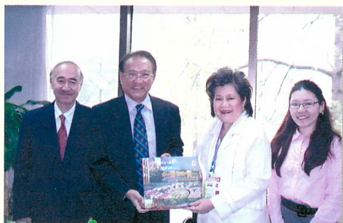
Courtesy call to the Royal Thai Consulate, Guangzhou, China, November 5, 2008