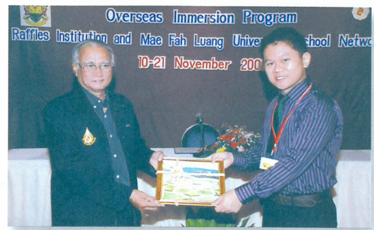
Overseas Immersion Program, Raffles Institution, Singapore and Mae Fah Luang University School Network, November 10-21, 2008 at MFU