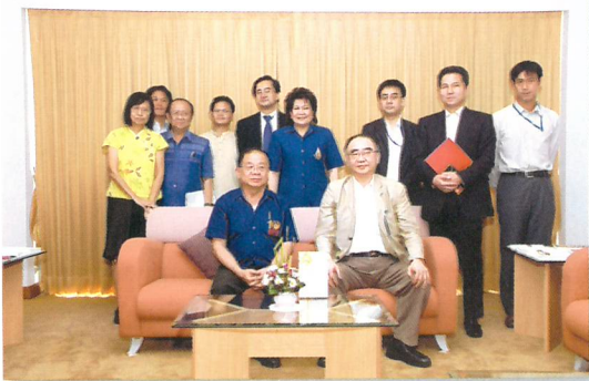
The Japanese Oversea Development Cooperation, Japan, visited MFU, October 3, 2008