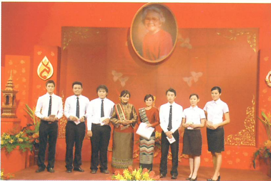
International student live broadcasting at NBT, Chiang Mai to celebrate the 10th anniversary of MFU, September 21, 2008