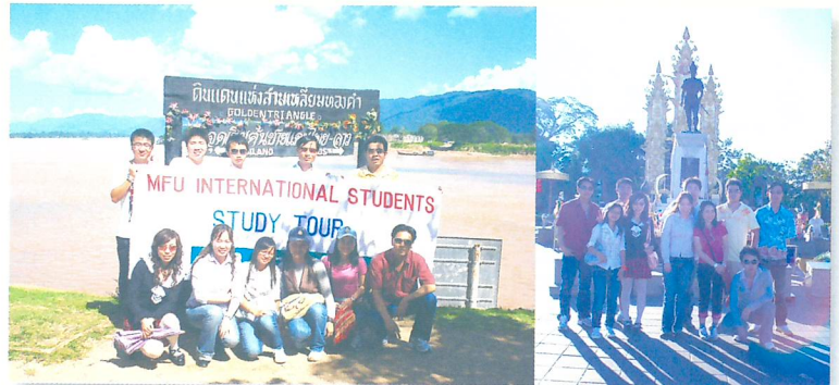
International Affairs Division arranged the study tour for International freshly students, Chiang Rai November 8, 2008