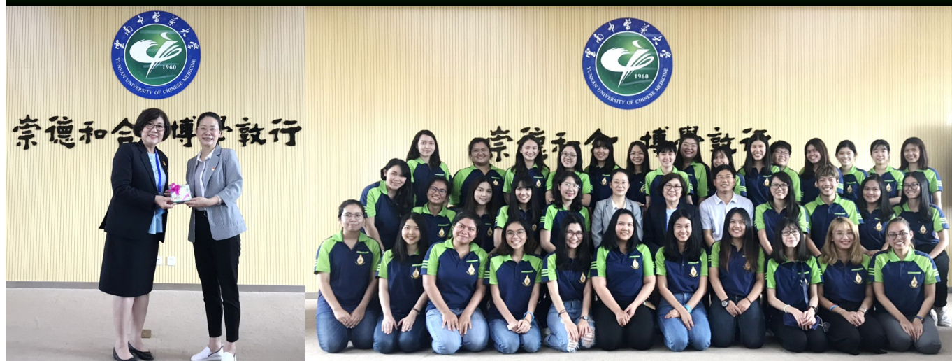
The Official Visit to the Group of 37 MFU Exchange Students at Yunnan University of Chinese Medicine, China