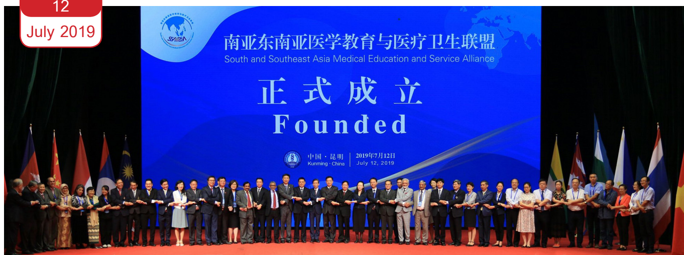
Attendance at the Inaugural Ceremony of the South and Southeast Asia Medical Education and Service Alliance (SSAMESA) at Kunming Medical University, China