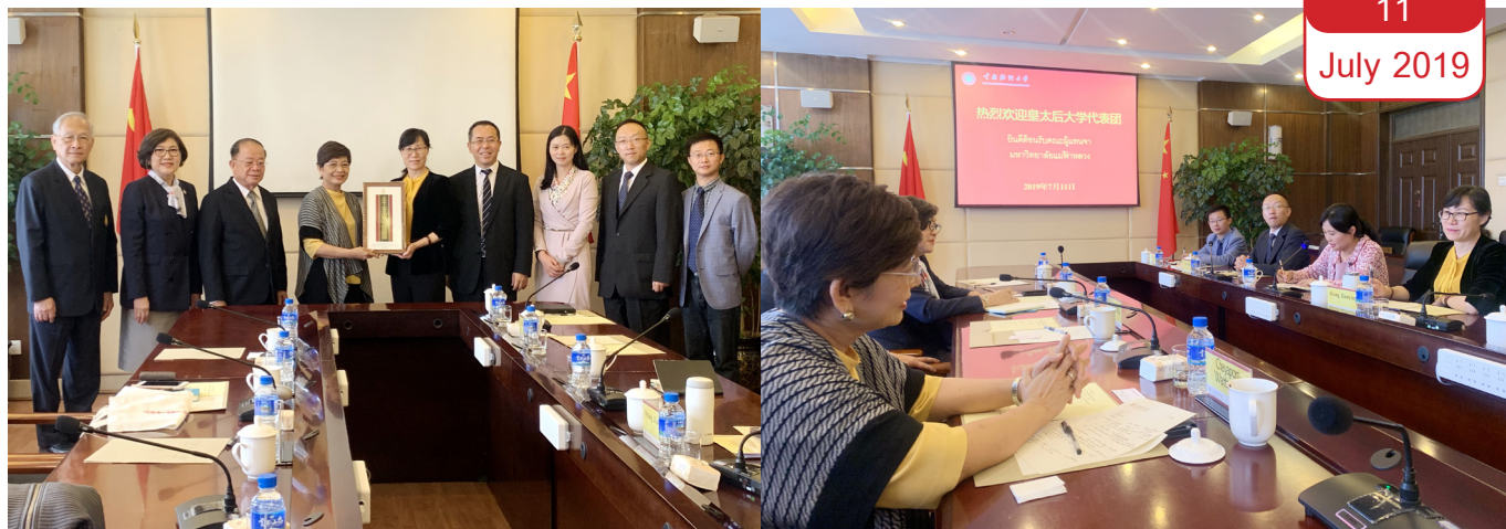
Discussion on Further Academic Cooperation with Yunnan University of Finance and Economics (YUFE), China