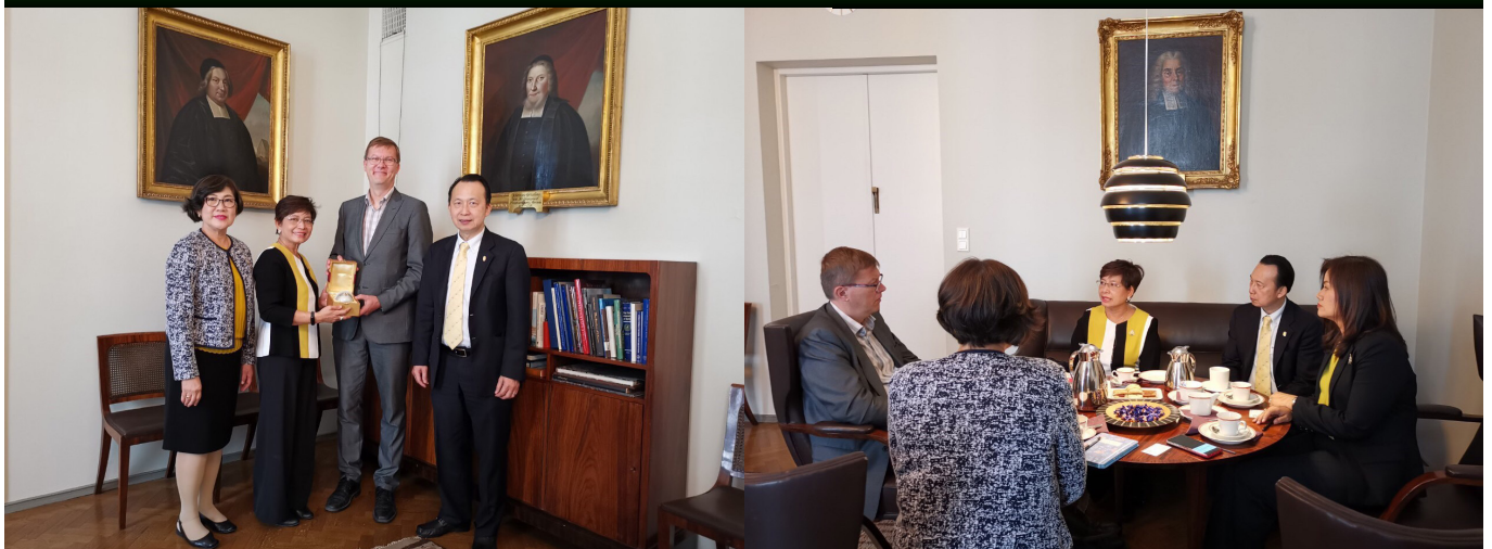
A Visit to University of Helsinki, Finland