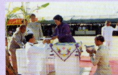
The Foundation-Stone Laying Ceremony of Chinese Language and Culture Center on December 9,2000

1. To carry on HRH the Princess Mother's determination for long term, environmentally sound development to enhance the quality of life of the people of Thailand