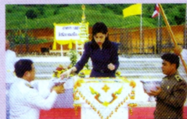
The Foundation-Stone Laying Ceremony of MFLU office building on May 2,2000

Local Chiang Rai people have donated the land where MFLU was established. It is situated at the foothill of Doi Ngam Mountain, covering approximately 1,998 acres. There are two other prospective campus sites in Mae Lao and Mae Suay District, with 1,023 and 289 acres respectively.