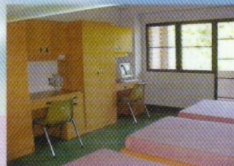
28 m 2 bedroom

MFLU provides on campus dormitories for its students. These offer a safe environment and convenience for the students.