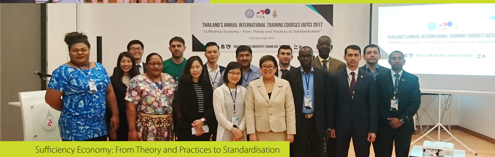
Sufficiency Economy: From Theory and Practices to Standardisation