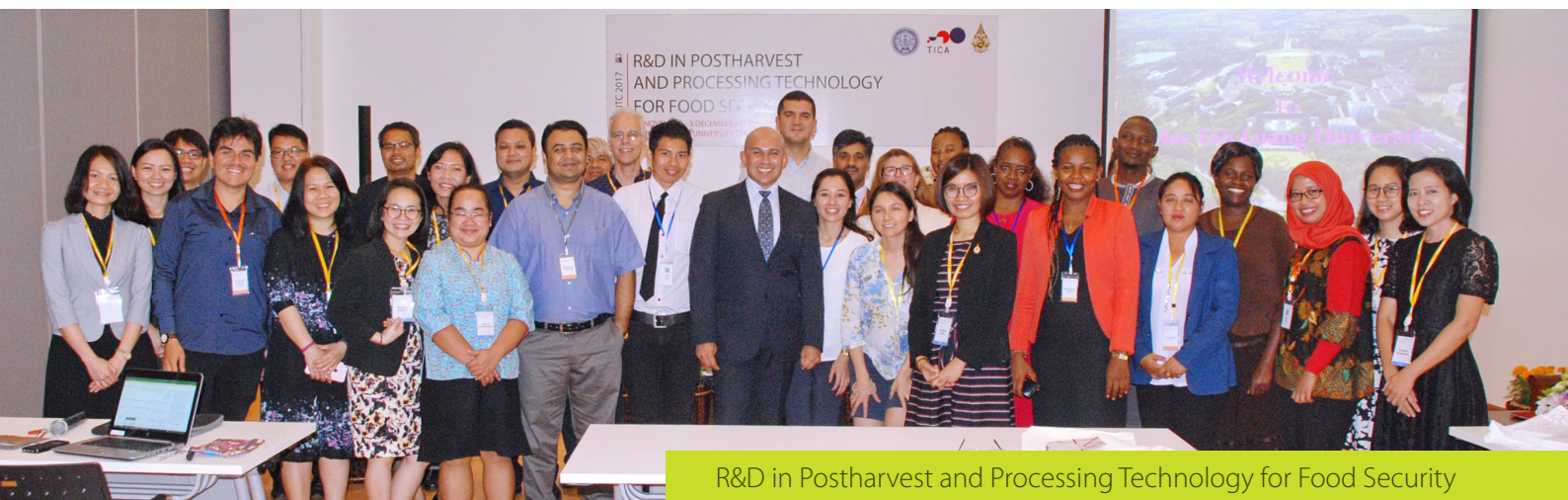
R&D in Postharvest and Processing Technology for Food Security